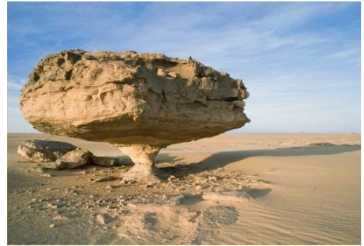
Figure 2: A situation that's sensitive to perturbation amplitude.

Consider the response force F_R at positive and negative F_A . Is it approximately an even or odd function? If this were exactly true (i.e., symmetry or antisymmetry between pushing and pulling) what is the first term in the Taylor series that could make F_R sensitive to amplitude of F_A ? It is an odd function. Thus, we expect the c_3(F_A)^3 term to be the first amplitude sensitive one.