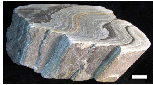
Figure 1: A folded rock.

The schist depicted has been twisted and folded, so that its original parallel sedimentary layers have been stretched, rotated, and squeezed like taffy. This problem will explore some possibilities of stretching and squeezing operations as represented by matrices.